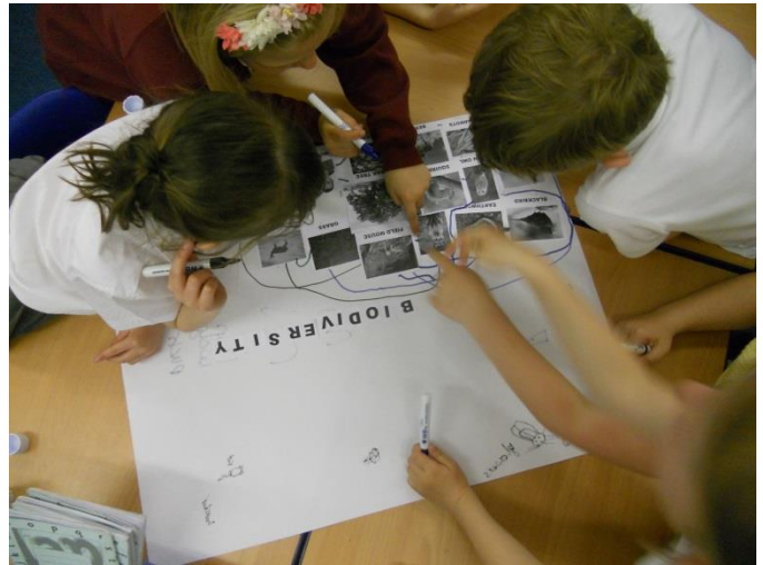
Both photos show Year 3 children exploring how different areas within nature are connected

You can visit The Wilderness Foundation in Chatham Green, Chelmsford. Their website is :- www.wildernessfoundation.org.uk .