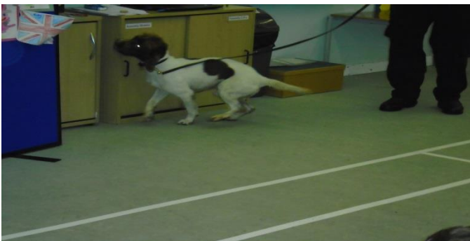
One of the sniffer dogs in action.