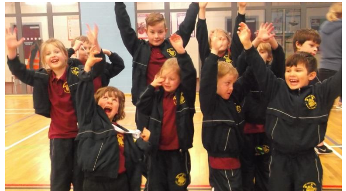
Our wonderful “All-In” team

The children thoroughly enjoyed the experience and came back to school excited and eager to tell us about their adventure.