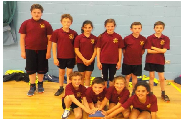
Year 5 Basketball Team.