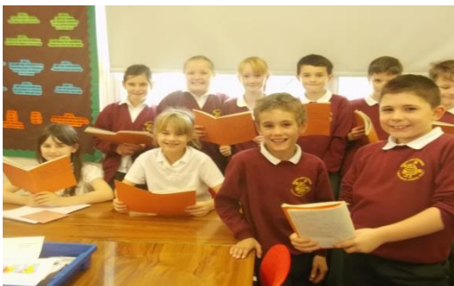
Year 5 children presenting their poetry