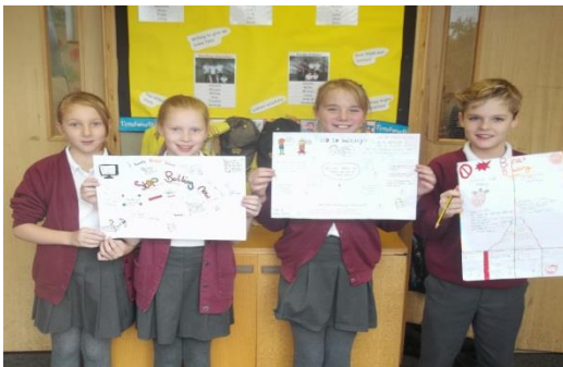
Year 6 showing their anti-bullying posters